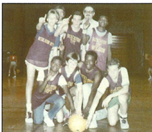
The 's 1985 7th-8th Grade Boys Basketball Division II tournament champion Colonials.

If you recognize the people in the photos, you can call us at 252-265-7808, email us at sports@wilsontimes.com or just leave a comment on the