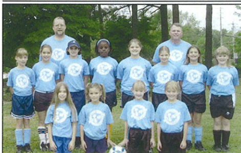
The Gators girls soccer team in the 's Ages 9-10 girls league for fall soccer in 2003.

N early each week in The Wilson Times, we will run a couple or three old photos of teams, players or events. Today's photos are the 1985 7th-8th Grade boys basketball Division II tournament champion Colonials and the 2003 Ages 9-10 girls soccer team, the Gators.