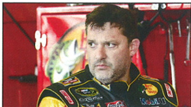
NASCAR driver Tony Stewart has not raced since he struck and killed a fellow driver who left his car and was on the track in a race Aug. 9 at Canandaigua Motorsports Park in upstate New York.